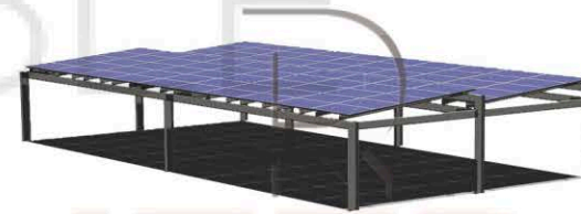
Modular structure for cover parkings