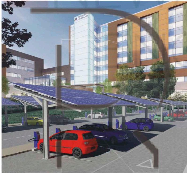
Simple canopy for parking