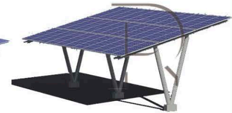
Double canopy with double pillar